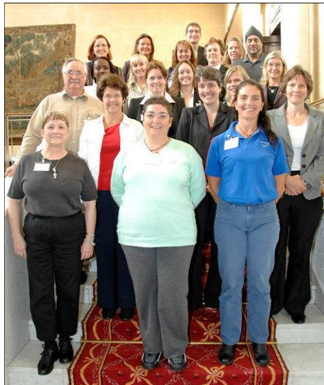
AWE Conference attendees